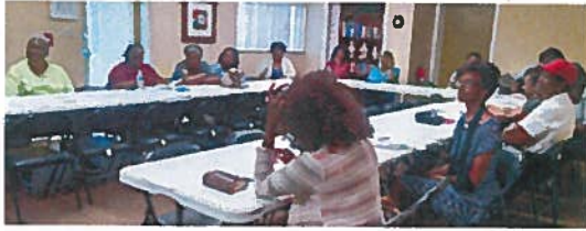
Members of the Kinship Caregivers Support Group meeting about financial literacy.

The purpose of the support group is to bring caregivers together to discuss issues that are meaningful, productive and meant to reduce a caregiver's feeling of isolation. Group members learn from and share their common concerns. Each month, representatives from the community are invited to share information and resources from caregiver's voiced concerns. Join the group for an always INSPIRATIONAL GOOD TIME!!